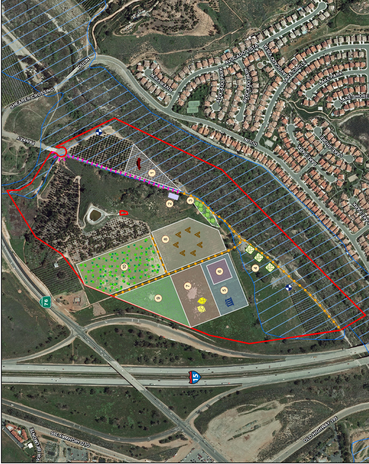
Pala Gateway Project: Environmental Assessment ■ Figure 2-1 Proposed Pala Gateway Cultural Center