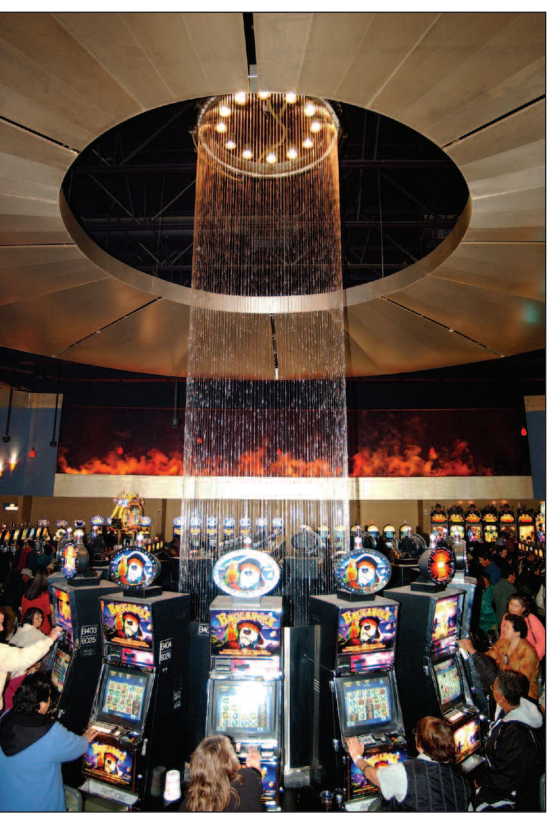
The expansive slot floor at Spotlight 29 Casino.

to visit the Casino Bar, which is located in the middle of the slot floor. The comfortable bar offers numerous flat-screen televisions so guests can enjoy sporting events. Guests can also just relax with a cocktail and watch the gaming action surrounding them. Our next stop was Café Capitata, which is the perfect spot for casual, informal dining. Totally renovated in 2005, the venue is a unique, 24-hour café that includes a five-station buffet. Guests can enjoy dishes ranging from American and Asian to Italian and Mexican, as well as a soup/salad bar and dessert bar.