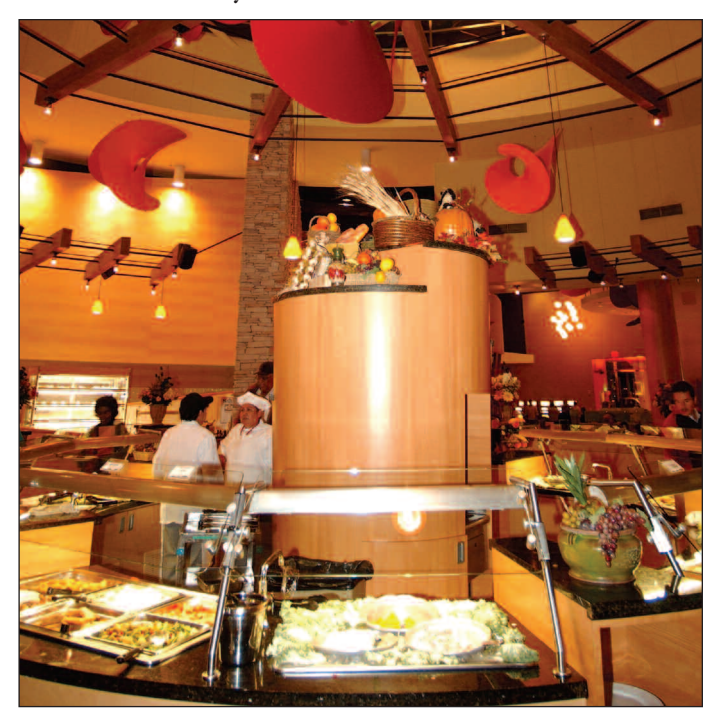
Café Capitata, Spotlight 29's 24-hour cafe restaurant.

We made our way down to the main level of the casino floor