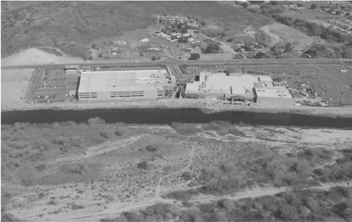
Plate 3: View of the Pala Casino from the South.