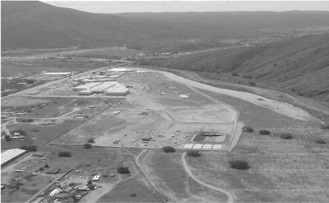
Plate 9: View of the Rincon Casino from the West.