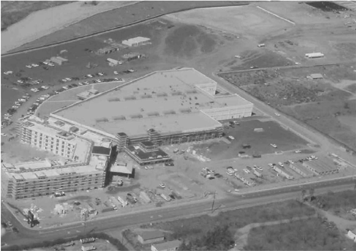
Plate 7: Close-up View of the Rincon Casino from the Northwest.