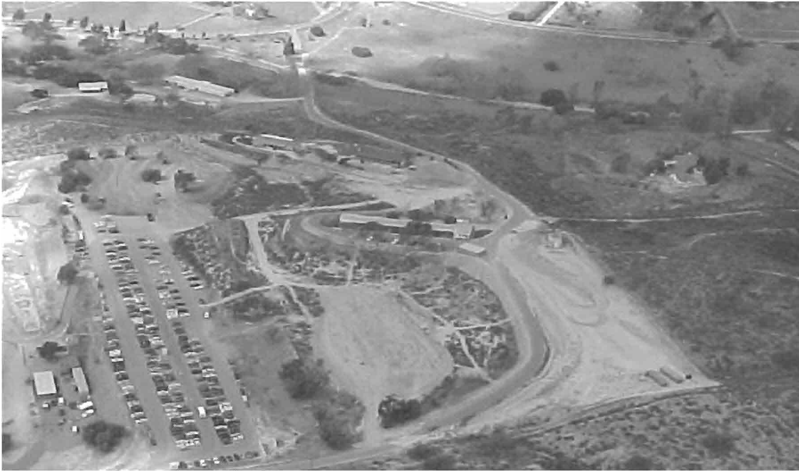
Plate 21: Close-up View of Sycuan Casino's Eastern Parking Lots from the East.