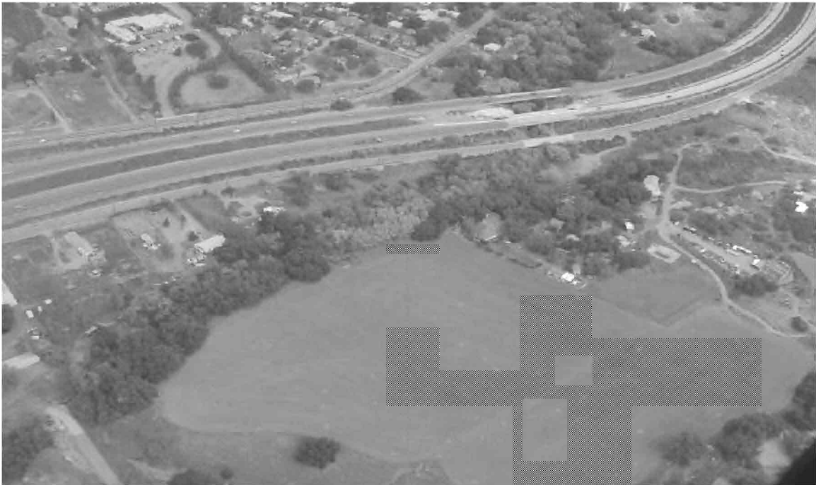
Plate 13: View of the Proposed Ewiiapaayp Tribal Health Clinic Site from the Southwest.