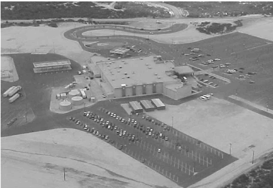
Plate 22: Close-up View of Campo (Golden Acorn) Casino from the Northeast.