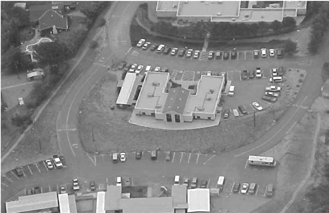
Plate 17: Close-up View of the Tribal Health Clinic, Site of the Proposed Ewiiapaayp Casino, from the North.