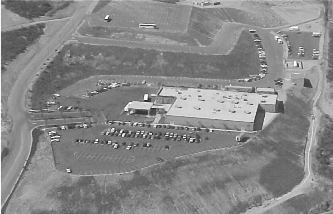
Plate 10: Close-up View of the San Pasqual Casino from the East.