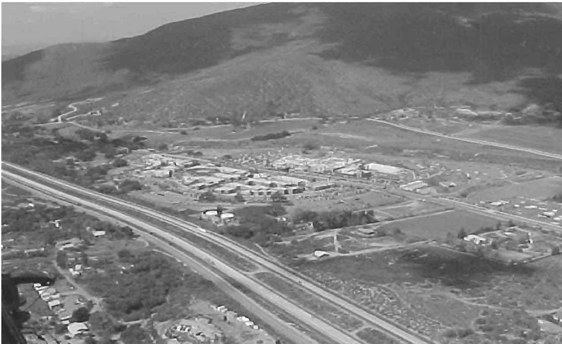
Plate 18: View of the Viejas Casino and Turf Club, and Outlet Center from the Southeast.