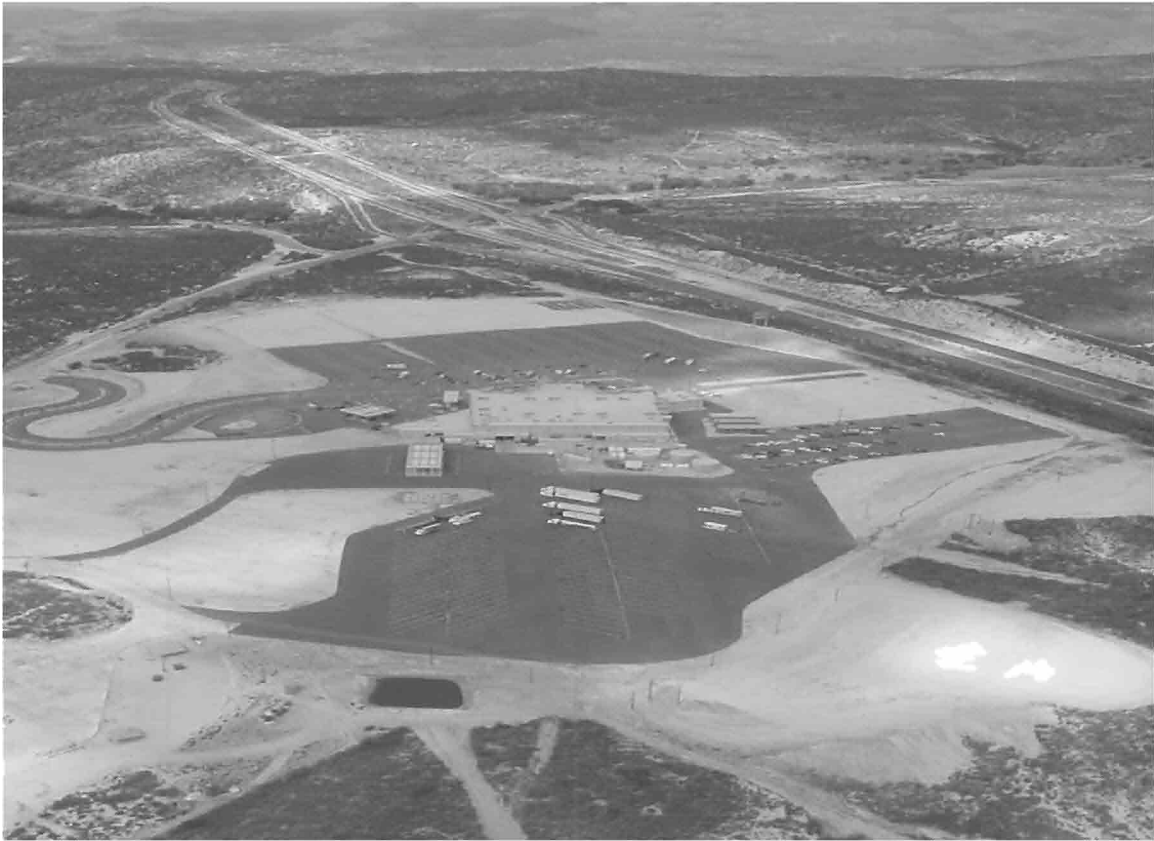
Plate 25: View of Campo (Golden Acorn) Casino from the Southeast.