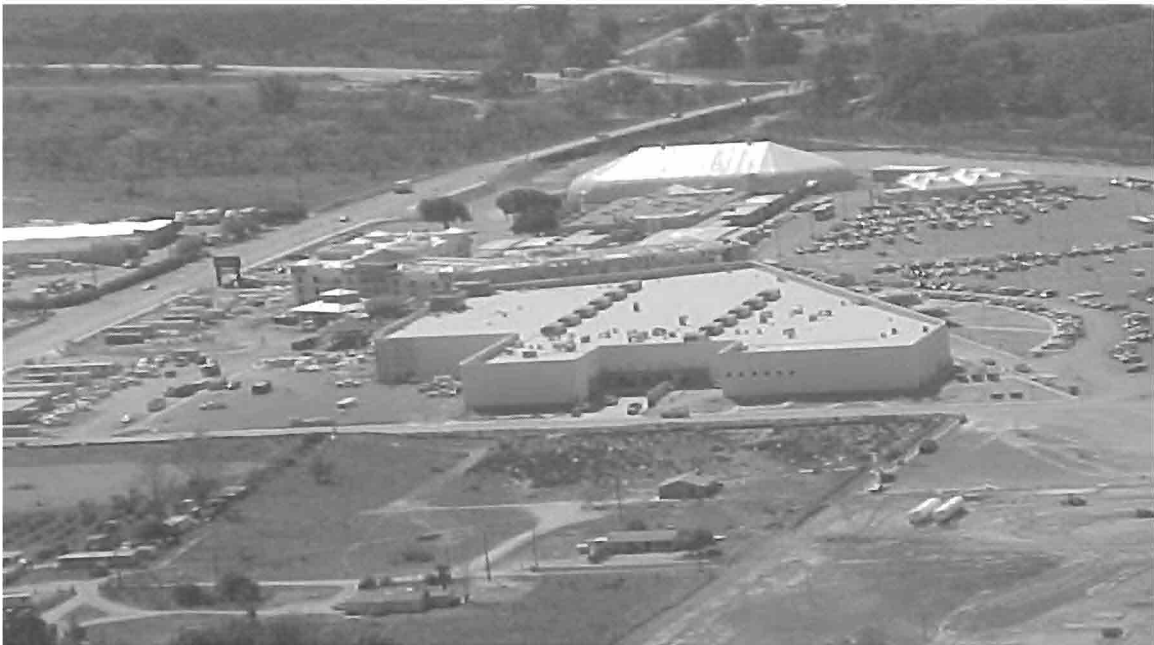
Plate 6: Close-up View of the Rincon Casino from the West.