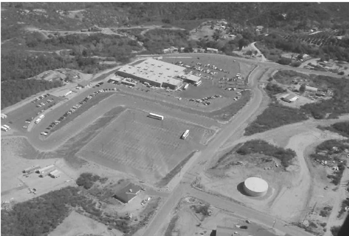
Plate 12: View of the San Pasqual Casino from the North.