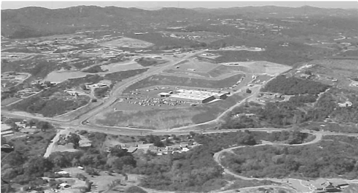
Plate 11: View of the San Pasqual Casino from the Southeast.