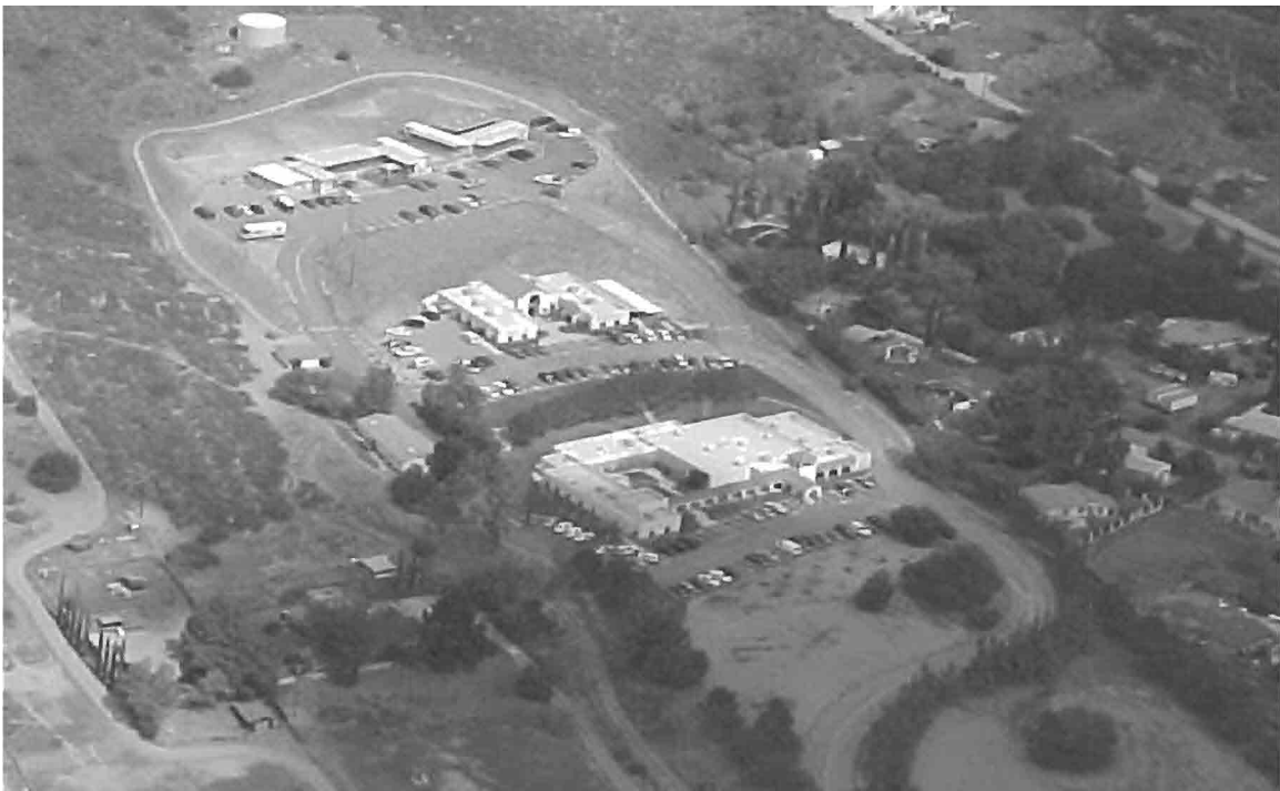
Plate 16: View of the Tribal Health Clinic, Site of the Proposed Ewiiapaayp Casino, from the Southwest.