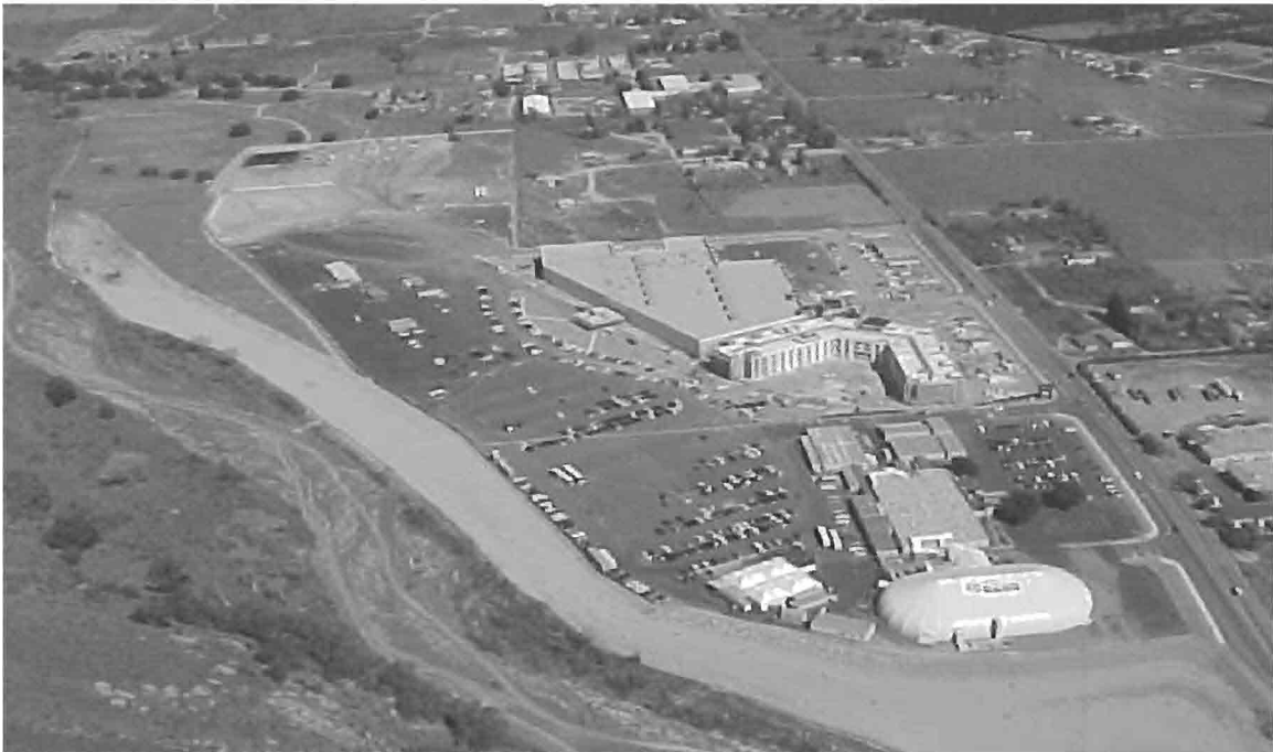
Plate 8: View of the Rincon Casino from the East.