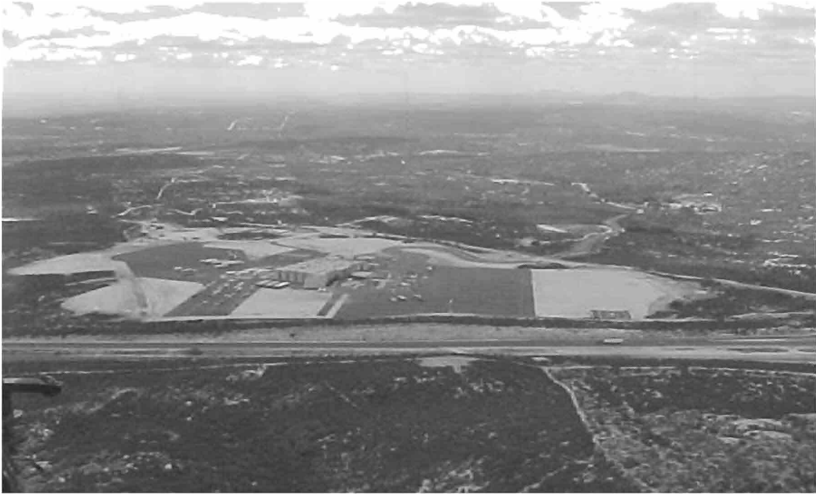
Plate 23: View of Campo (Golden Acorn) Casino from the North.