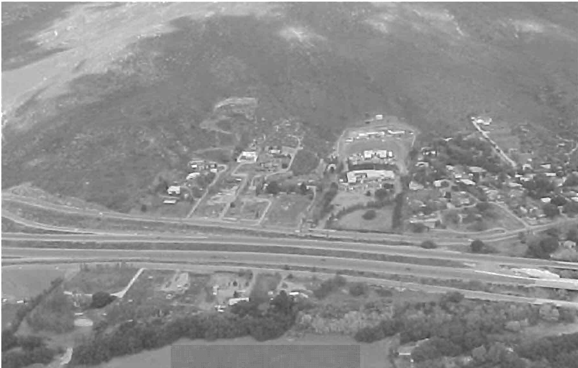
Plate 15: View of the Tribal Health Clinic, Site of the Proposed Ewiiapaayp Casino, from the South.