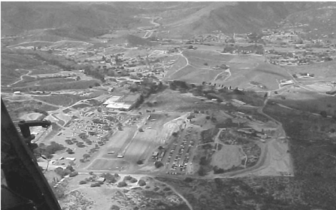
Plate 20: View of Sycuan looking West.