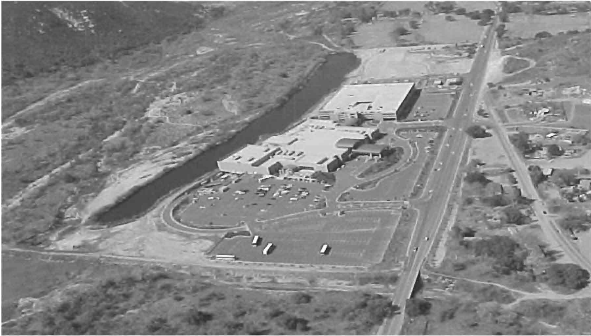
Plate 1: View of the Pala Casino from the East.