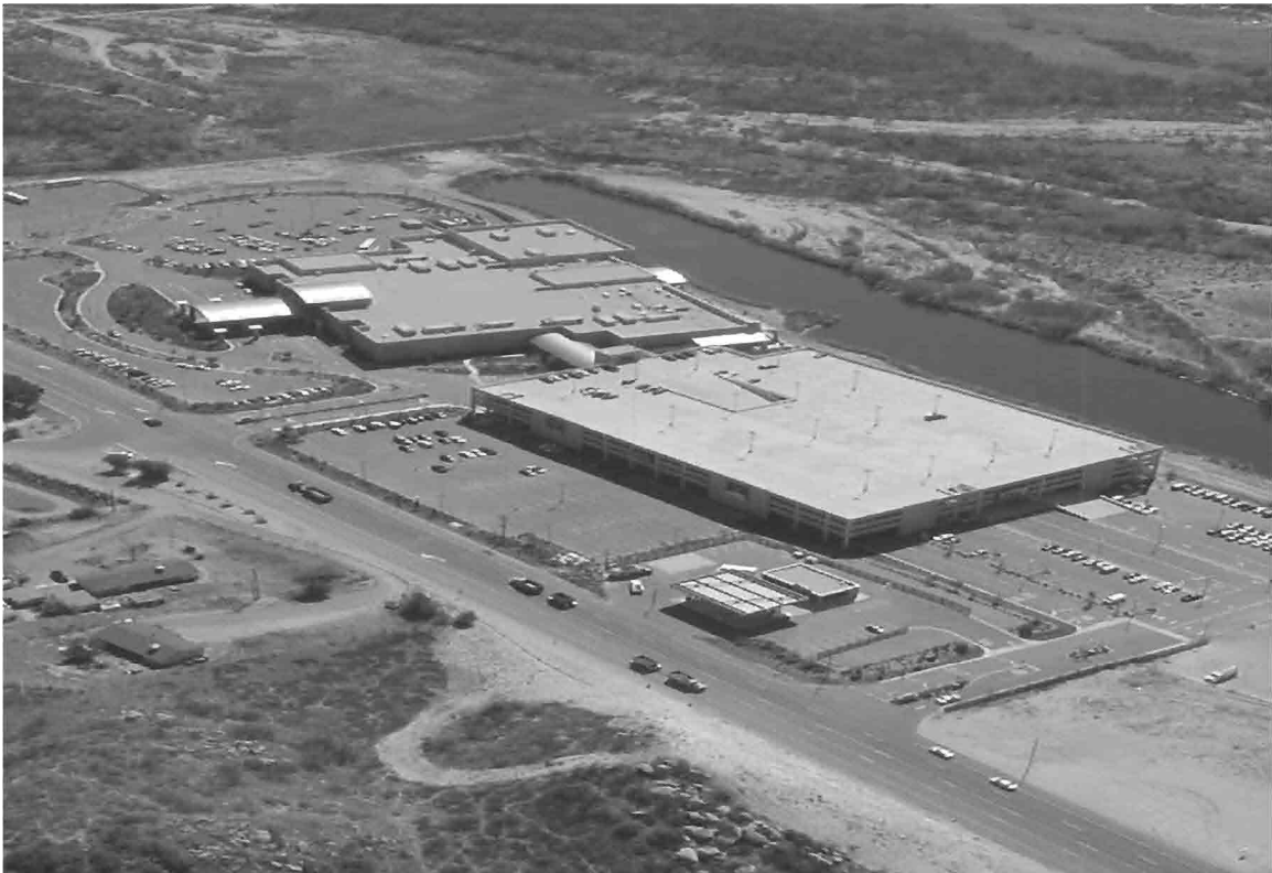
Plate 2: View of the Pala Casino from the Northwest.