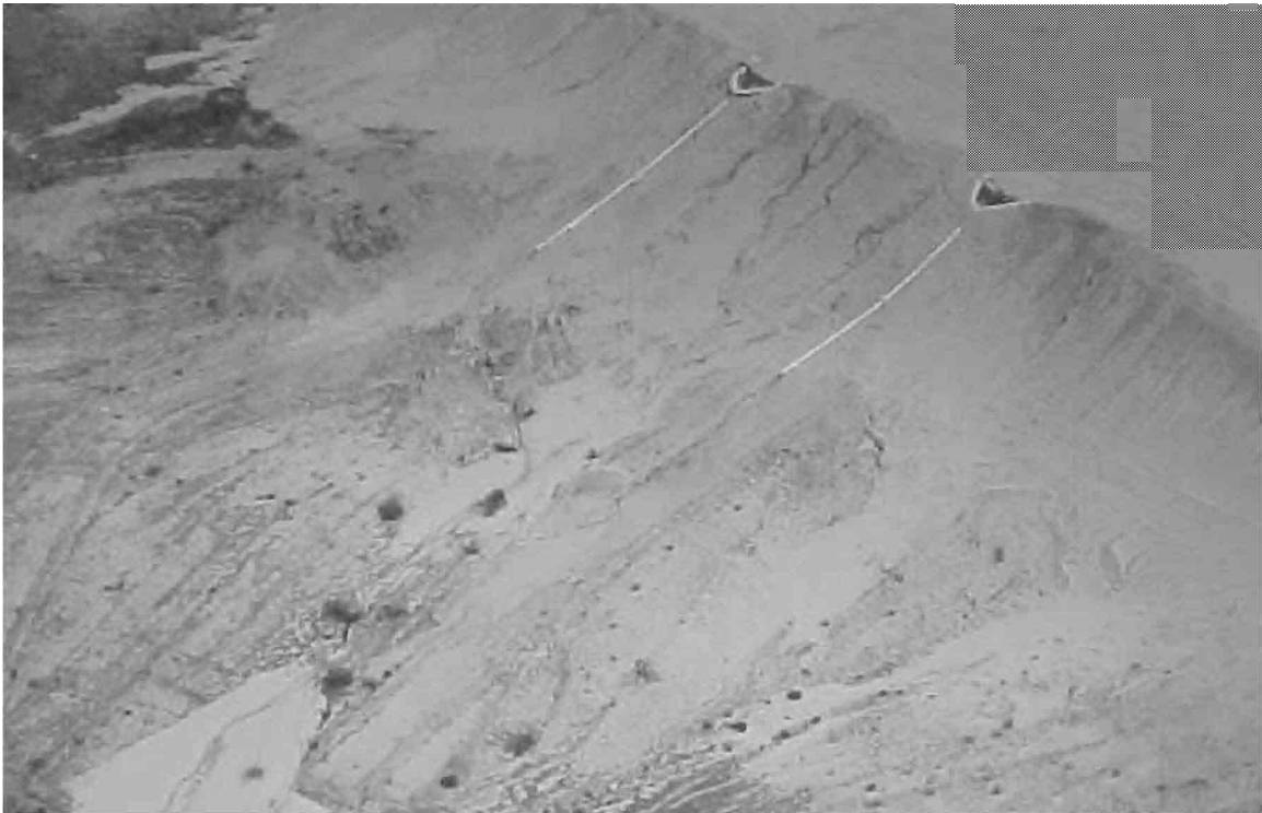
Plate 24: View of Campo (Golden Acorn) Casino Drainages from the North.