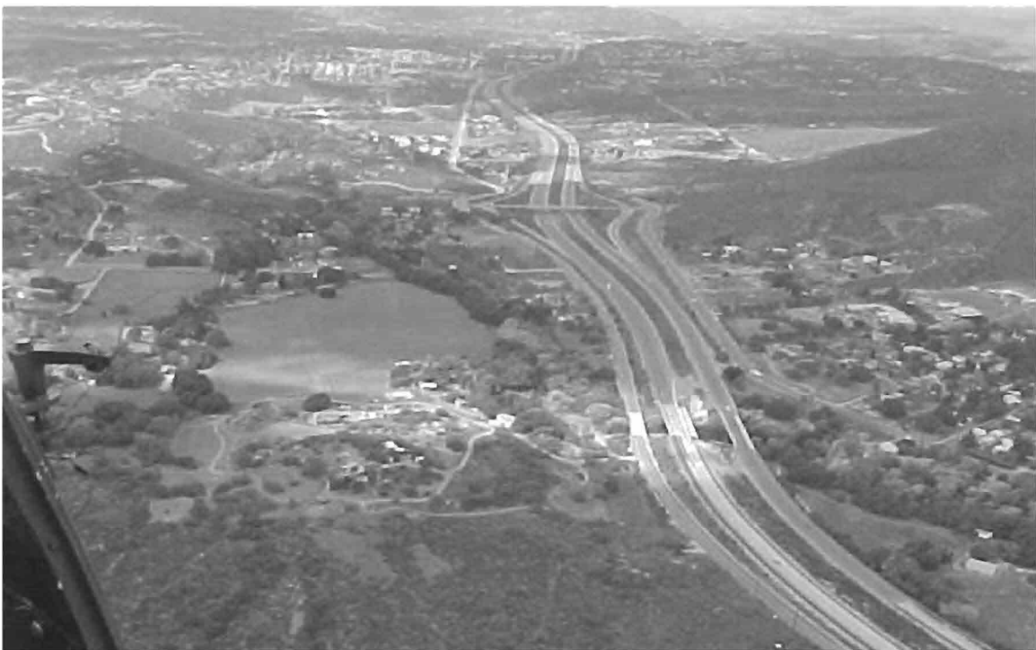
Plate 14: View of the Proposed Ewiiapaayp Tribal Health Clinic Site from the East.