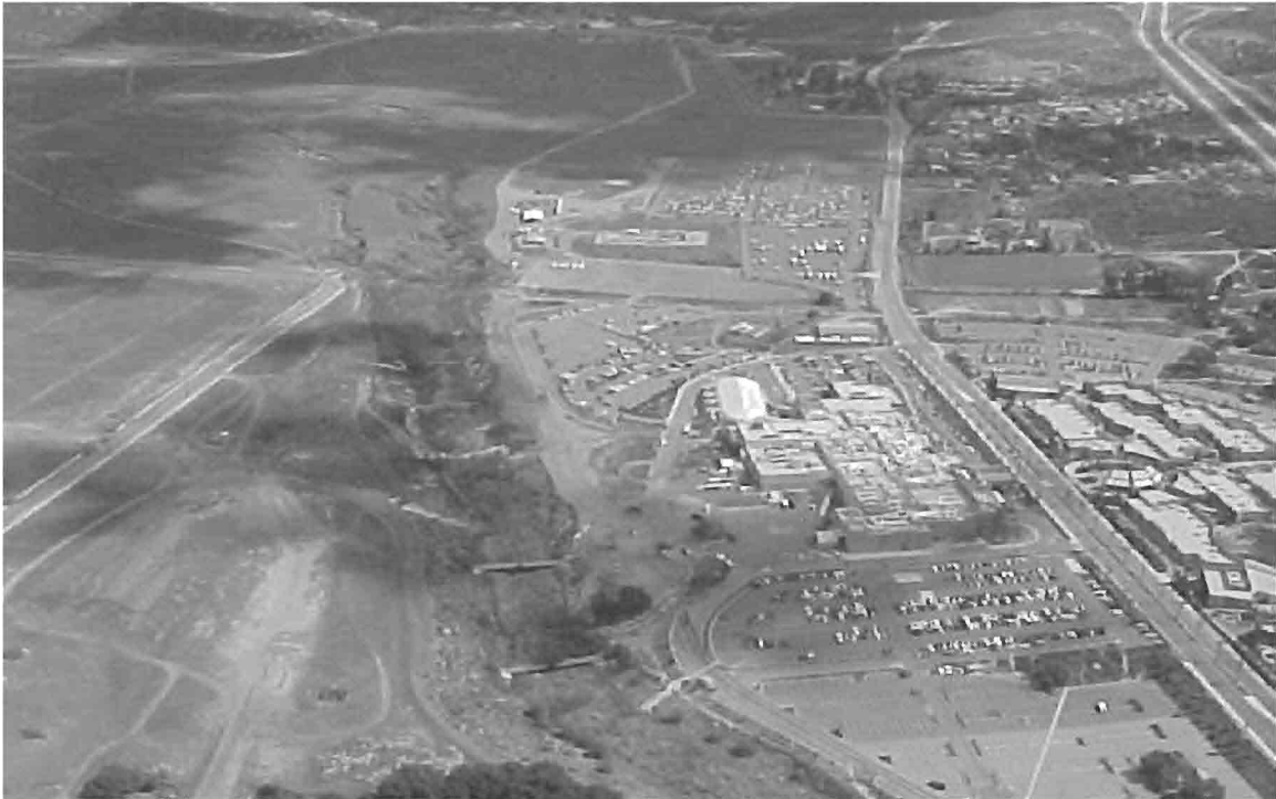
Plate 19: Close-up View of Viejas Facilities from the West.