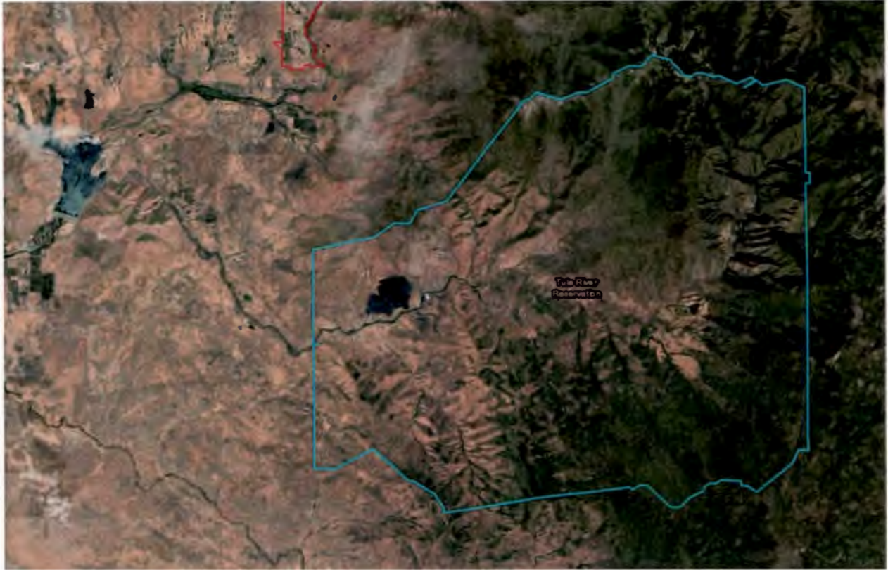
Reservation Rd. (Reservation Boundary to Rd. 296) & Success Valley Dr. (Reservation Rd to Sunshine Dr.)