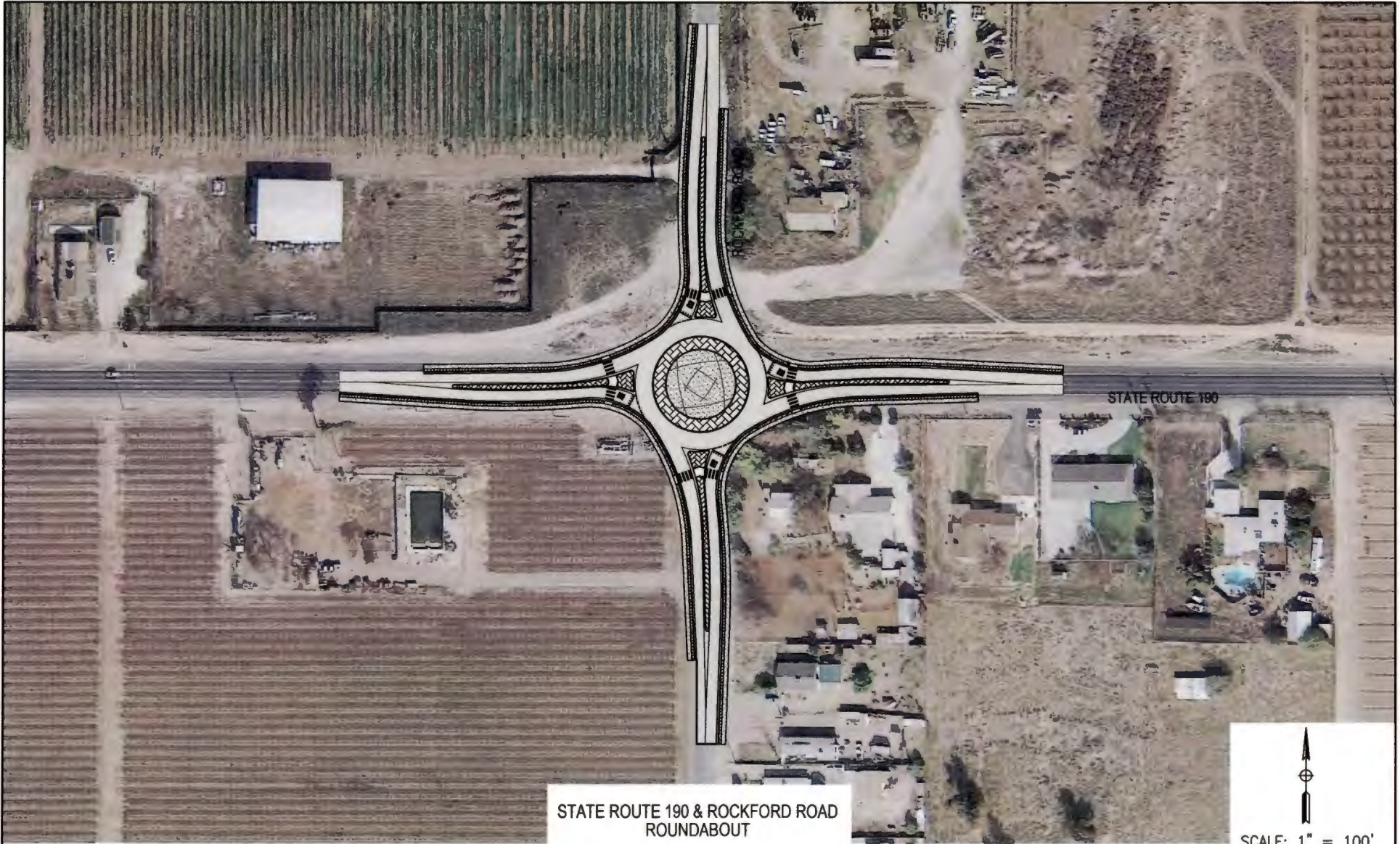
STATE ROUTE 190 & ROCKFORD ROAD ROUNDABOUT